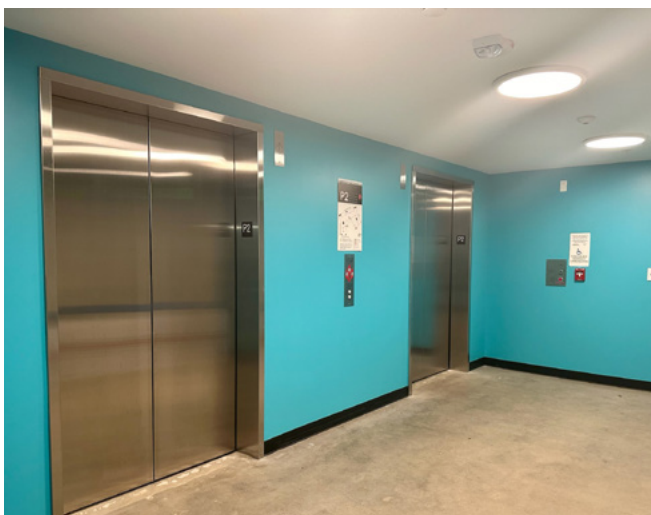
Elevator lobby on 2G, 3G and 4G