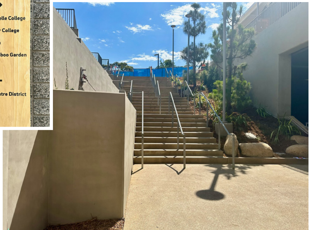
View of staircase from P1 (Parking Level 1) to ground/street level